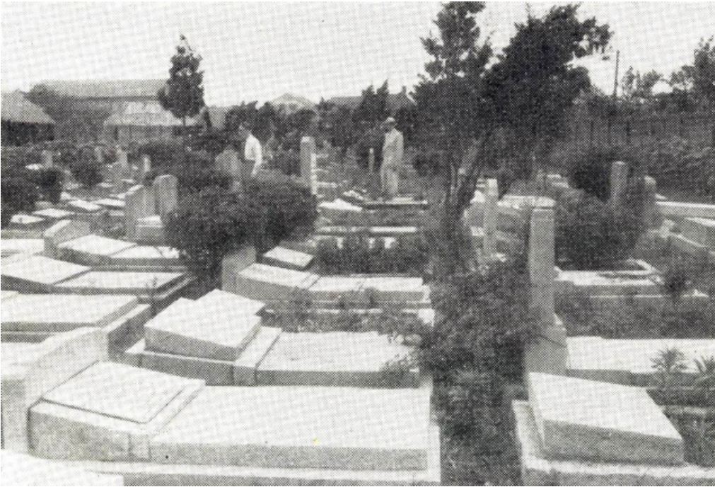
Fa Yuan-Lu Cemetery