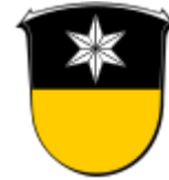
Coat of arms